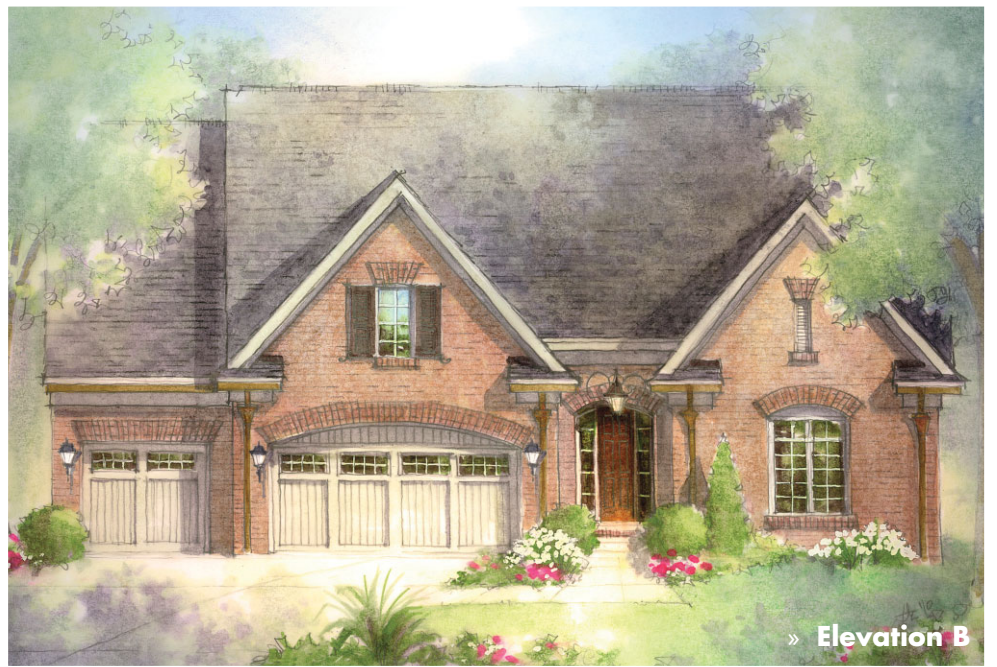
» Elevation B

The Durham is a masterpiece of spacious elegance. A standard 3-car garage and ample private rooms surround the uplifting family and dining area at the heart of the home. Entertainers and families will embrace the bright, airy way the dining and living spaces unfurl from the generous kitchen—offering a wealth of possibilities. A convenient laundry/mud room straight off the attached garage allows even the most chaotic family to exercise a little organization, while the study’s proximity to the shared space in the center of the house further encourages a sense of functional harmony.