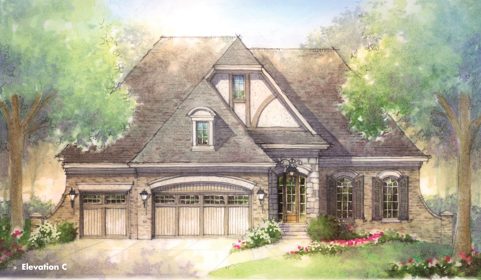
» Elevation C