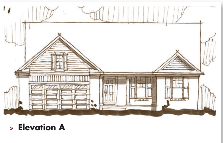
» Elevation A